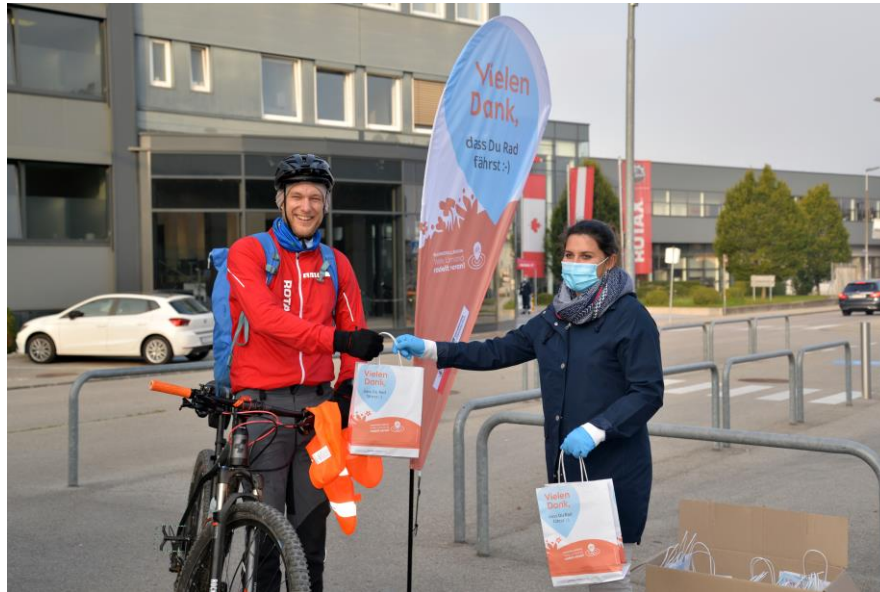
Breakfast Bag as thank you. @ BRP-Rotax

Gunskirchen, 22. September 2020 - A real successful event was the “European Car Free Day” at BRP-Rotax. This take place annually as part of the European mobility week. An initiative of the European Commission to protect environment and health.